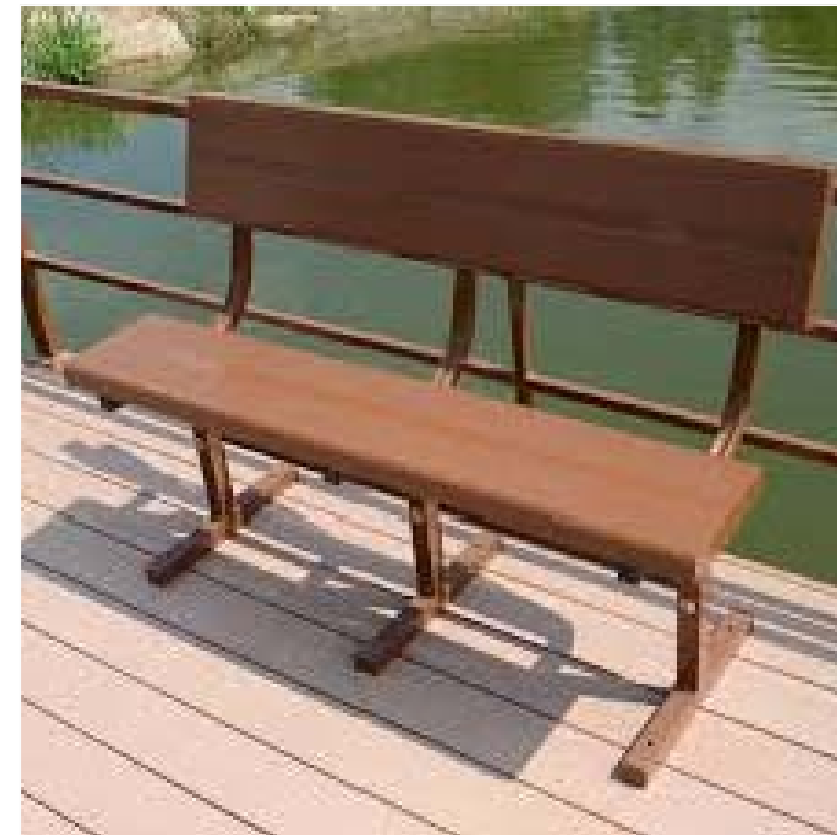
POWDER COATED DOCK BENCH BY POND KING (2 REQUIRED)