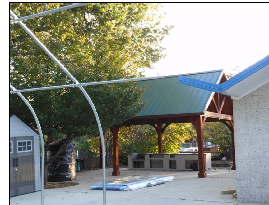
24' x 32' PAVILION