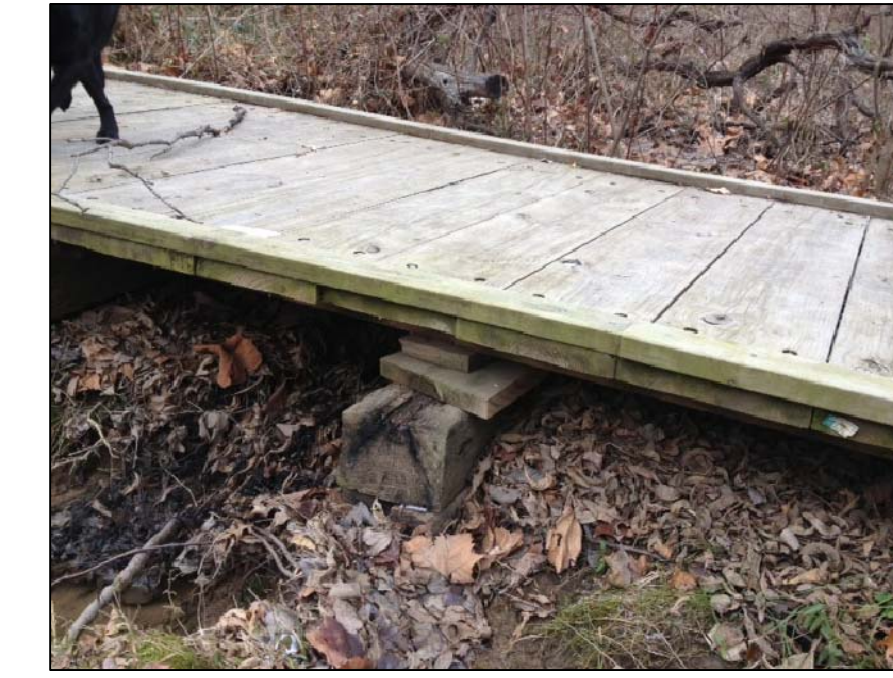
RAISED BOARDWARK OVER WETLANDS