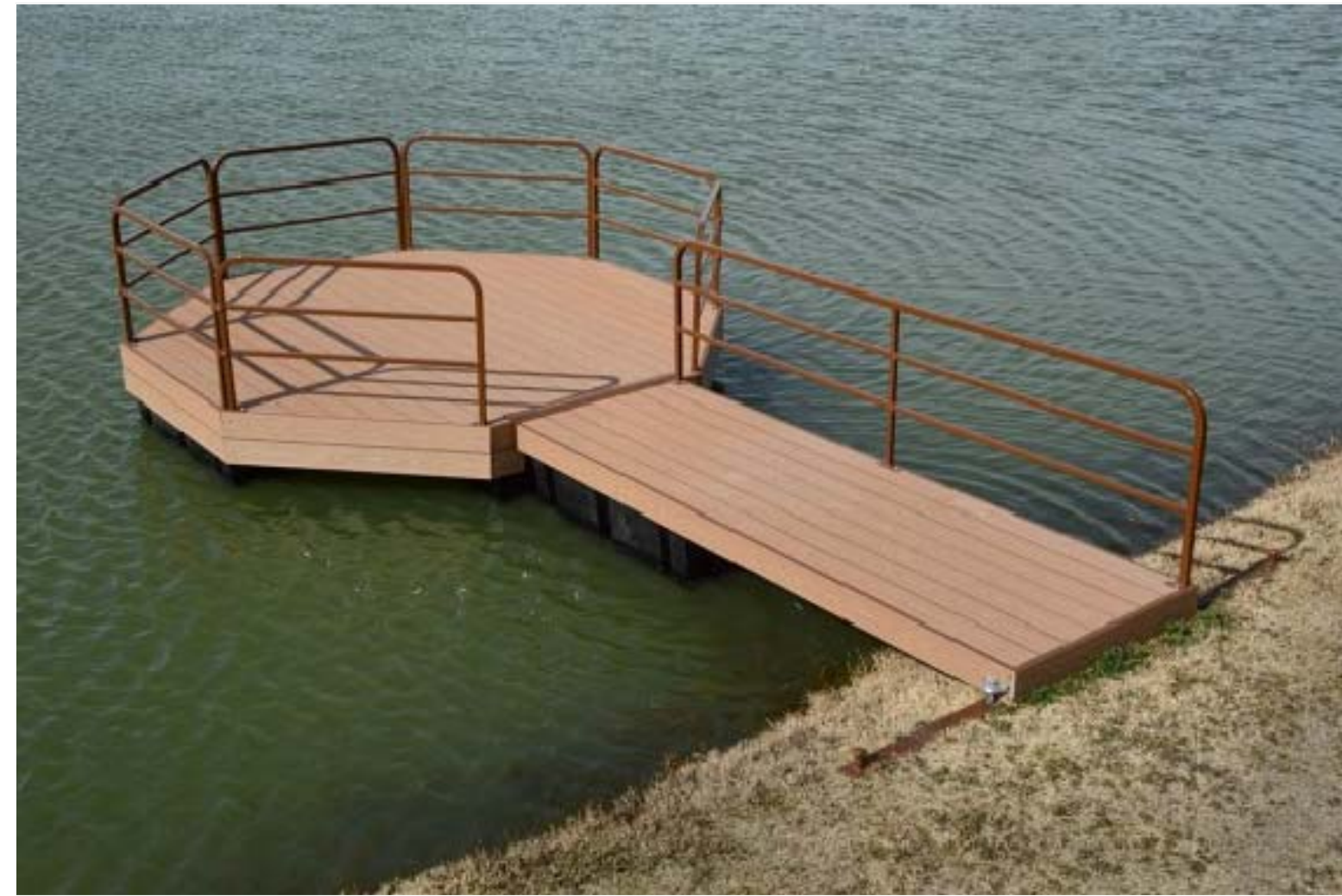
DOCK WITH OCTAGON RAILING PACKAGE