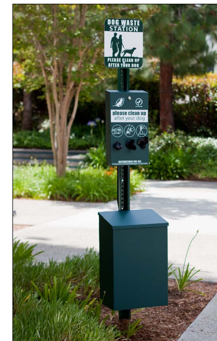
BENCH, TRASH RECP., GRILL, WASTE STATION BY DUMOR