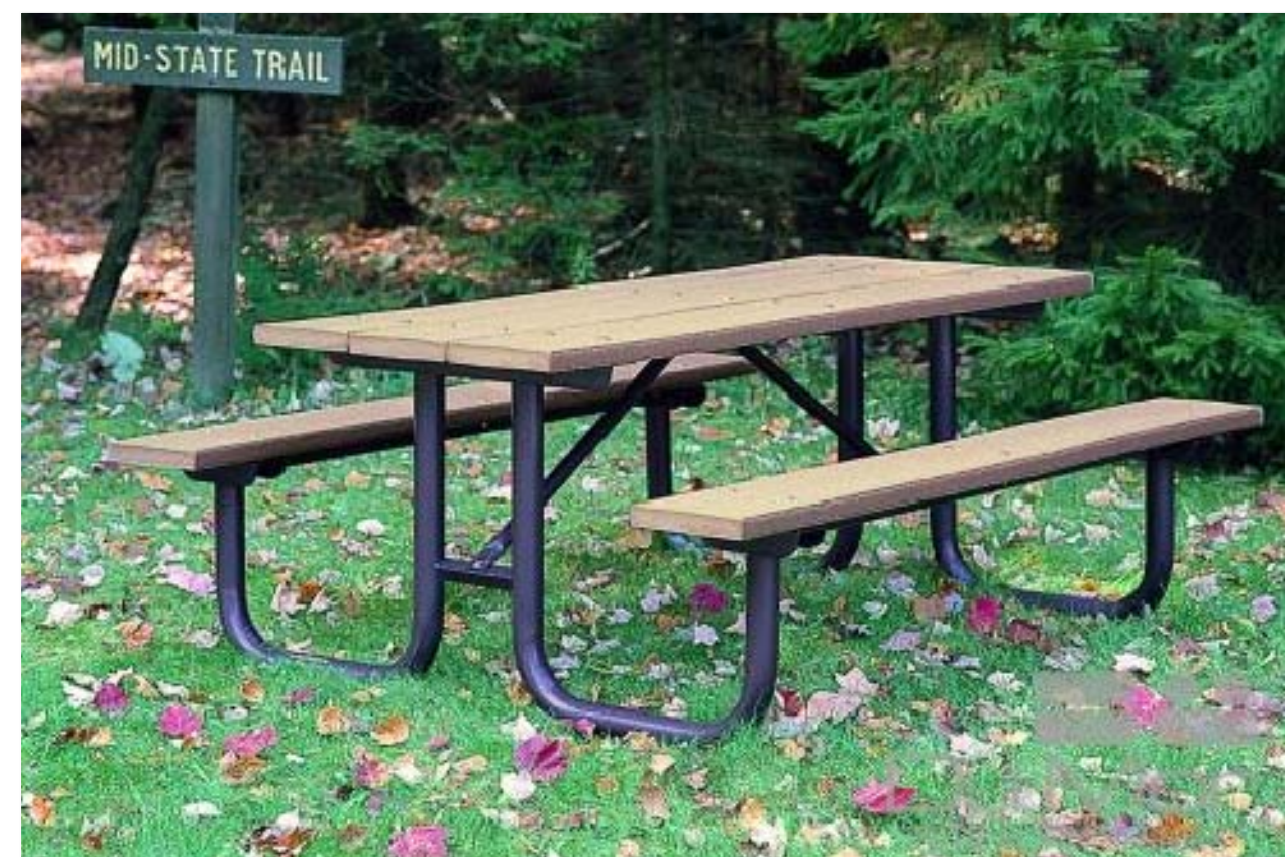
8FT. PICNIC TABLE: 77 SERIES BY DUMOR 4 REQUIRED (1-HC [77-68-1PL], 3- [77-80PL]) COLOR - POWDER COATED TEXTURED RUST SURFACE - CEDAR COLOR RECYCLED PLACTIC